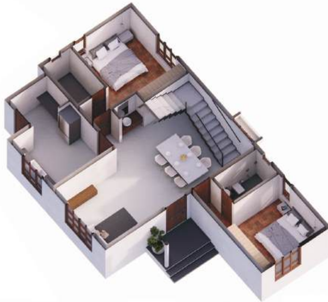
GROUND FLOOR ISOMETRIC