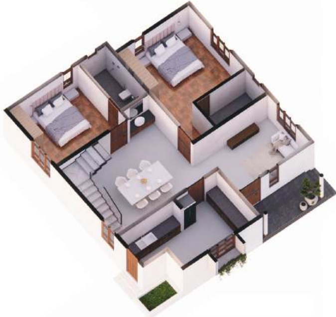
GROUND FLOOR ISOMETRIC

TOTAL BUILT - UP AREA 2460.73 sqft GROUND FLOOR AREA 1290.05 sqft FIRST FLOOR AREA 1170.68 sqft