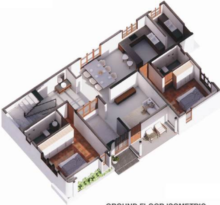
GROUND FLOOR ISOMETRIC

TOTAL BUILT - UP AREA 2472.34 sqft GROUND FLOOR AREA 1370.67 sqft FIRST FLOOR AREA 977.14 sqft STAIR ROOM 124.53 sqft