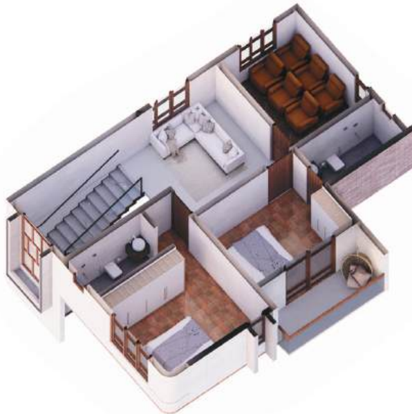
FIRST FLOOR ISOMETRIC

RERA AREA 1464.43 sqft OUTER WALL AREA 230.24 sqft BALCONY & SITOUT 126.47 sqft