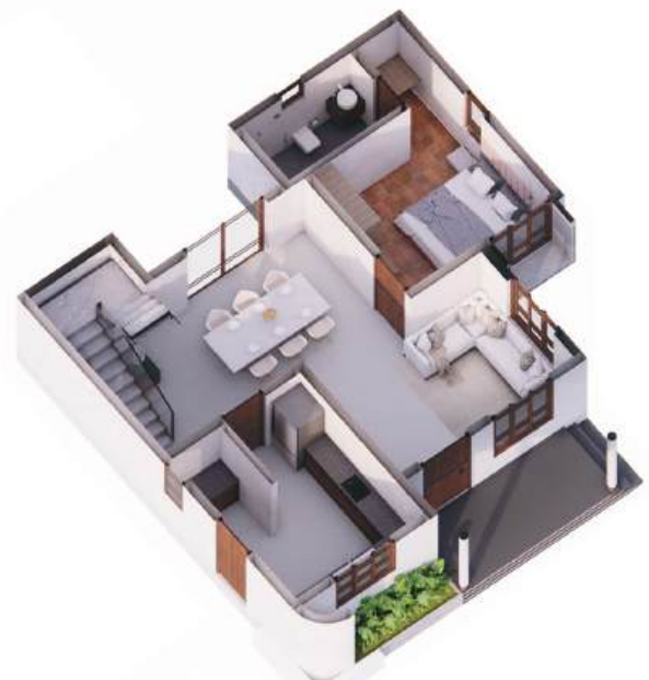
GROUND FLOOR ISOMETRIC

TOTAL BUILT - UP AREA 1740.52 sqft GROUND FLOOR AREA 887.59 sqft FIRST FLOOR AREA 852.93 sqft