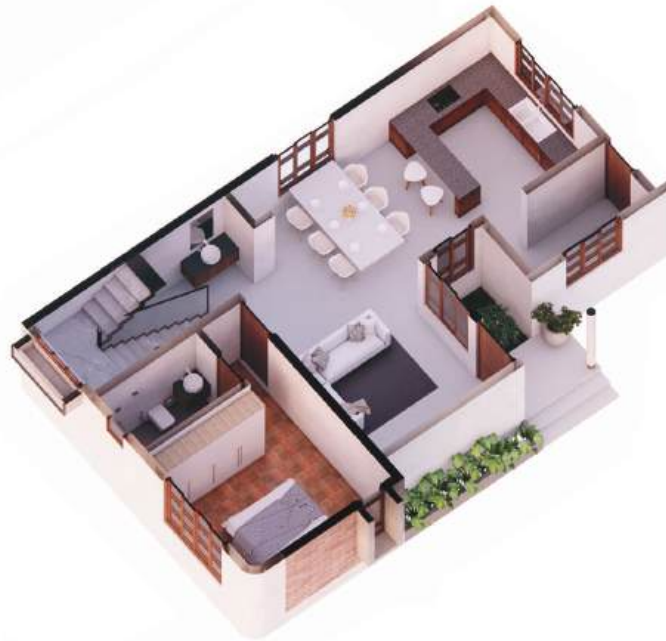
GROUND FLOOR ISOMETRIC