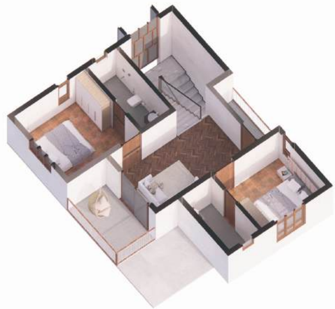
FIRST FLOOR ISOMETRIC

RERA AREA 1238.49 sqft OUTER WALL AREA 192.45 sqft BALCONY & SITOUT 156.50 sqft