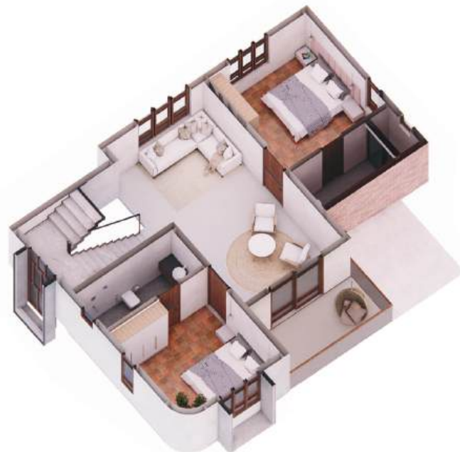
FIRST FLOOR ISOMETRIC

RERA AREA 1493.49 sqft OUTER WALL AREA 233.36 sqft BALCONY & SITOUT 160.92 sqft