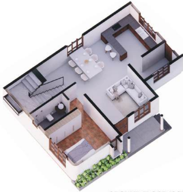
GROUND FLOOR ISOMETRIC

TOTAL BUILT - UP AREA 2168.38 sqft GROUND FLOOR AREA 1010.73 sqft FIRST FLOOR AREA 1010.73 sqft STAIR ROOM 146.92 sqft