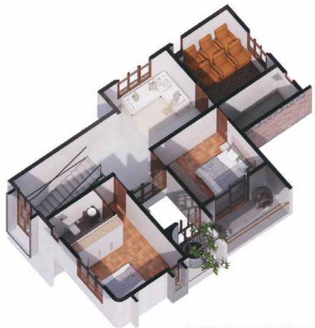
FIRST FLOOR ISOMETRIC