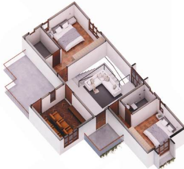
FIRST FLOOR ISOMETRIC