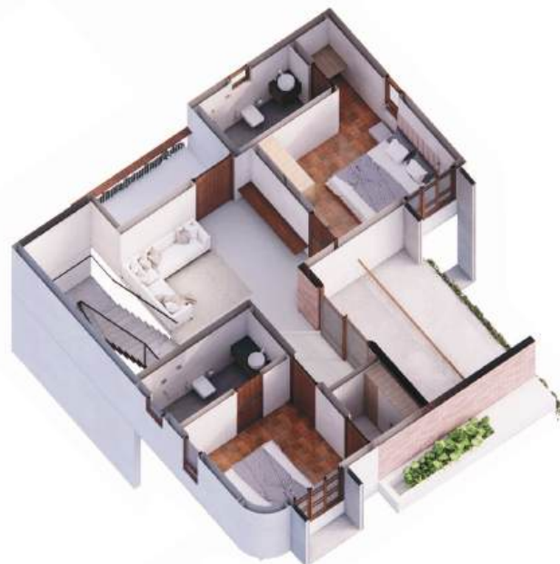
FIRST FLOOR ISOMETRIC

RERA AREA 1207.06 sqft OUTER WALL AREA 201.39 sqft BALCONY & SITOUT 167.37 sqft