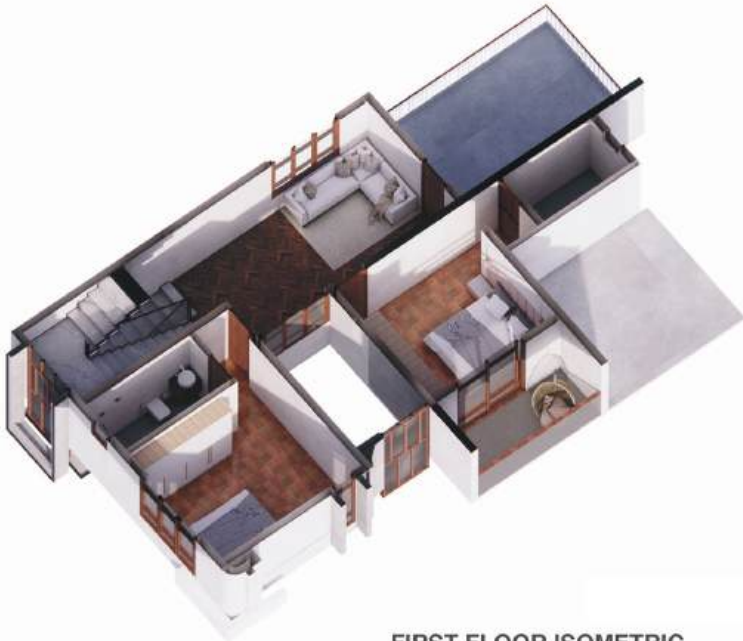
FIRST FLOOR ISOMETRIC