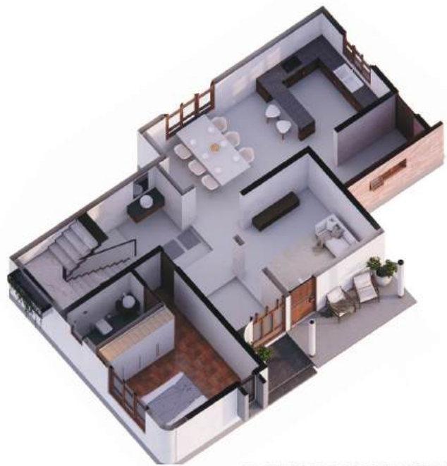
GROUND FLOOR ISOMETRIC

TOTAL BUILT - UP AREA 2344.25 sqft GROUND FLOOR AREA 1134.83 sqft FIRST FLOOR AREA 1082.63 sqft STAIR ROOM 126.79 sqft