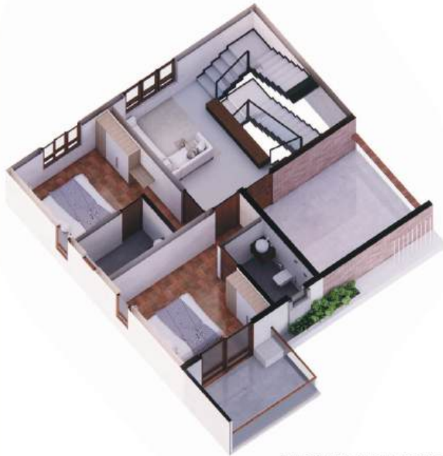
FIRST FLOOR ISOMETRIC