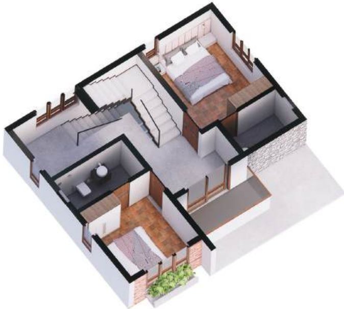
FIRST FLOOR ISOMETRIC