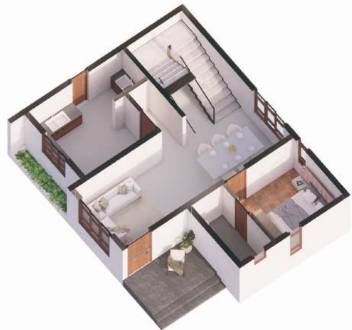
GROUND FLOOR ISOMETRIC

TOTAL BUILT - UP AREA 1766.03 sqft GROUND FLOOR AREA 919.13 sqft FIRST FLOOR AREA 846.90 sqft