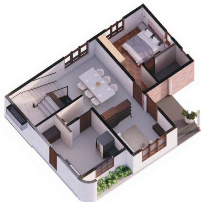
GROUND FLOOR ISOMETRIC

TOTAL BUILT - UP AREA 1812.85 sqft GROUND FLOOR AREA 935.70 sqft FIRST FLOOR AREA 877.15 sqft