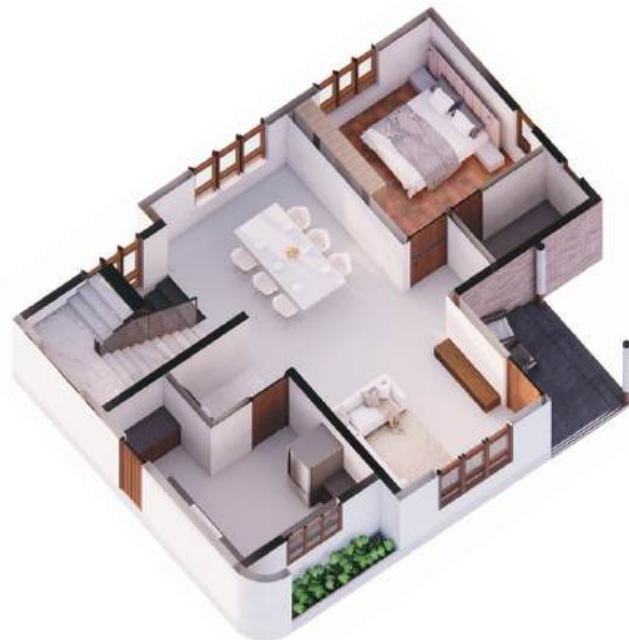
GROUND FLOOR ISOMETRIC

TOTAL BUILT - UP AREA 2161.49 sqft GROUND FLOOR AREA 1031.61 sqft FIRST FLOOR AREA 1003.62 sqft STAIR ROOM 126.26 sqft