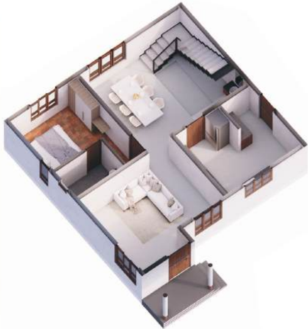
GROUND FLOOR ISOMETRIC

TOTAL BUILT - UP AREA 1966.55 sqft GROUND FLOOR AREA 989.41 sqft FIRST FLOOR AREA 830.86 sqft STAIR ROOM 146.28 sqft