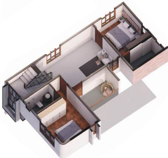
FIRST FLOOR ISOMETRIC