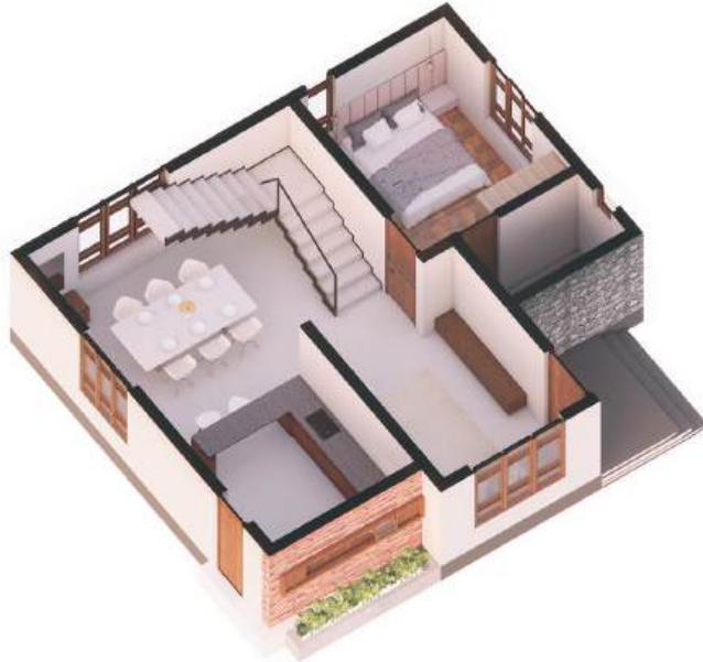
GROUND FLOOR ISOMETRIC

TOTAL BUILT - UP AREA 1826.09 sqft GROUND FLOOR AREA 846.15 sqft FIRST FLOOR AREA 765.74 sqft STAIR ROOM 214.20 sqft