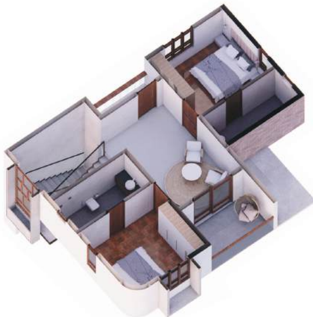
FIRST FLOOR ISOMETRIC

RERA AREA 1272.94 sqft OUTER WALL AREA 195.68 sqft BALCONY & SITOUT 135.19 sqft