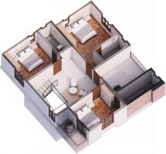
FIRST FLOOR ISOMETRIC